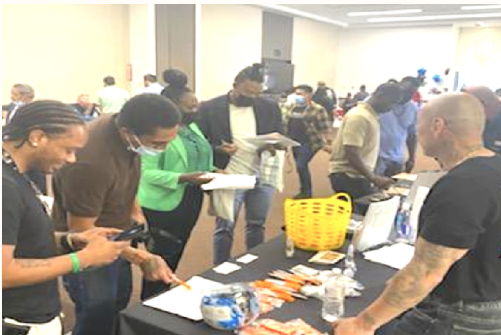
Visitors enjoying all the resources provided at our Job and Resource Fair